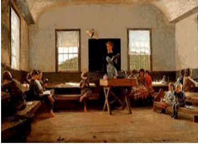
Winslow Homer, The Country School