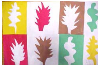
Second grade version of a Matisse Leaf Cut Out